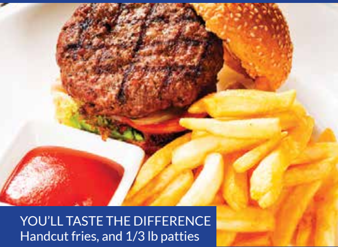
YOU'LL TASTE THE DIFFERENCE Handcut fries, and 1/3 lb patties