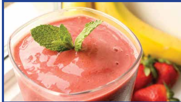
YOUR CHOICE OF A BASE: Choose from Almond Milk or Orange Juice.